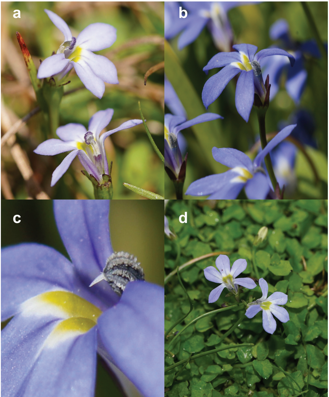
Figure 1. Lobelia pachytricha . a: female flowers (from near Drumborg, Victoria) https://www.inaturalist.org/observations/38650001 ; b: male flowers and c: closeup showing corolla coloration and short thick hairs on the dorsal surface of male anther tube (from near Mooralla, Victoria) https://www.inaturalist.org/observations/28831419 ; d: male plant (from near Hotspur, Victoria) https://www.inaturalist.org/observations/20976451 .