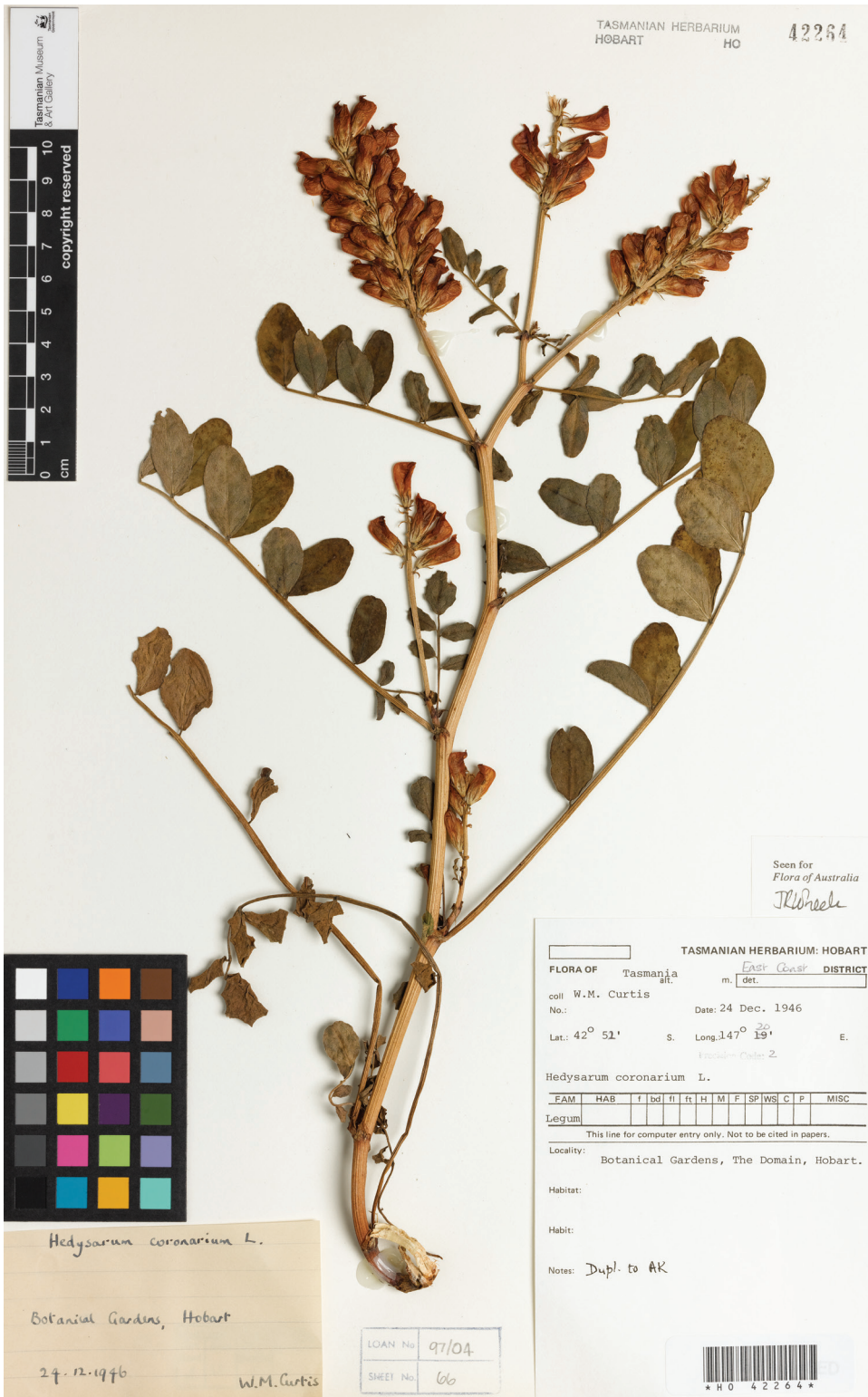
Figure 5. Hedysarum coronarium is considered to be not naturalised in Tasmania as it appears that it is only known from cultivated specimens.