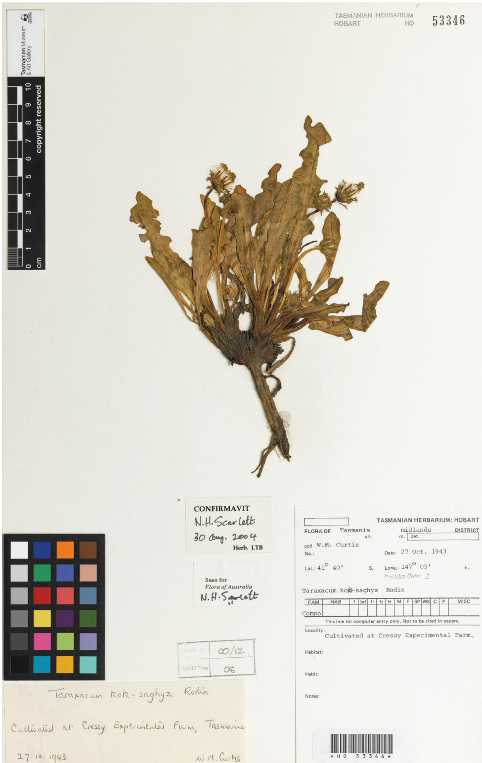
Figure 2. Taraxacum kok-saghyz has not been recorded since it was cultivated as a crop plant in the 1940s. It is considered to be not naturalised in Tasmania.