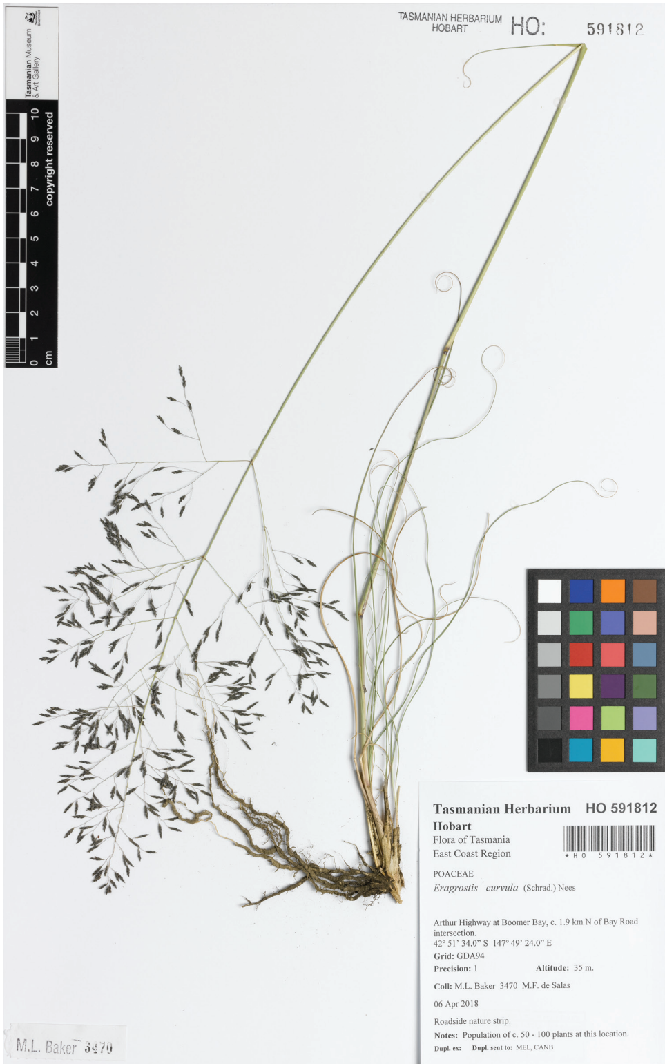
Figure 8. Eragrostis curvula was previously known to be sparingly naturalised in Tasmania. Recent surveys have shown the species to be a widespread and common naturalised weed of roadsides throughout the State.