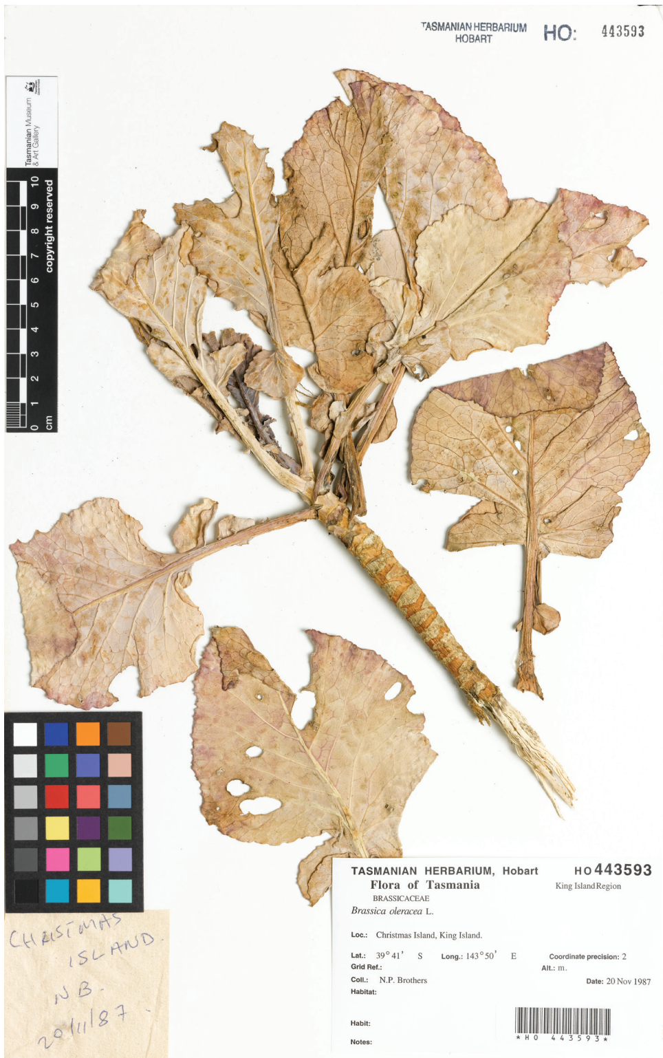
Figure 3. Brassica oleracea is an example of a species that is doubtfully naturalised in Tasmania. Although several specimens exist, and from disjunct locations, there are no notes to give any context as to the species' status.