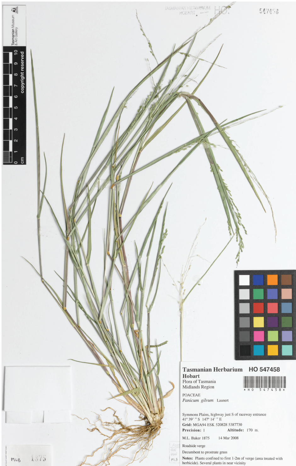
Figure 9. Panicum gilvum is known in Tasmania from two specimens collected from widely separated locations, both from roadside verges. The most recent collection was from a population consisting of several plants. The scarcity of collecting information associated with the specimens and the infrequent collections means there is some doubt regarding its status in Tasmania.