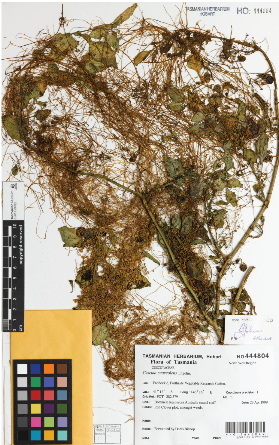
Figure 4. The parasitic herb Cuscuta suaveolens was recorded growing on weeds in a trial crop in Tasmania. Its discovery prompted a successful eradication program. Whilst it did not have the opportunity to form a self sustaining population, the potentially serious impacts of this species warrant it being listed as previously naturalised in Tasmania.