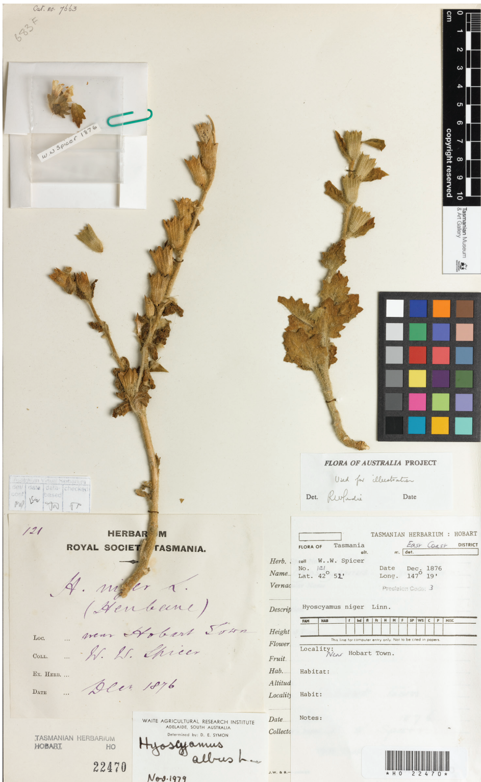
Figure 6. This is the only collection of Hyoscyamus albus from Tasmania. Without contextual collecting information, it cannot be used as evidence to assign a naturalised status.