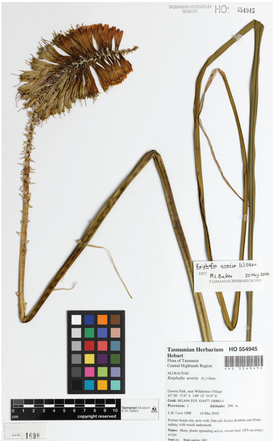
Figure 7. Recent collections of Kniphofia uvaria have shown that it has become naturalised and occurs in several populations in Tasmania. This is an example of a species that does not lend itself to easy collection or curation, so it is probably under-represented in the formal collection at the Tasmanian Herbarium.