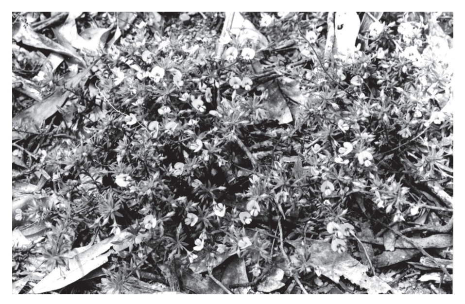
Figure 2. Habit photograph of Pultenaea dargilensis.

Distribution and habitat: Known only from the Dargile Forest, some of which is now incorporated into the Heathcote-Graytown National Park. Grows in box-ironbark forest on clay-loam soils derived from Devonian sediments. Associated species include Eucalyptus microcarpa (Maiden) Maiden, E. tricarpa (L.A.S.Johnson) L.A.S.Johnson, Acacia pycnantha Benth., A. acinacea Lindl., Cassinia arcuata R.Br., Hibbertia exutiaces N.A.Wakef., Brachyloma daphnoides (Sm.) Benth., Arthropodium strictum R.Br., Dianella admixta Gand.