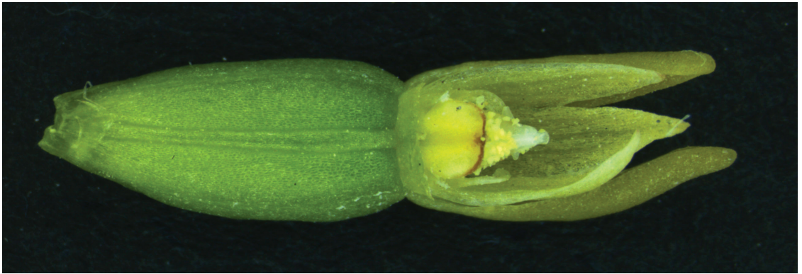
Figure 2. Prasophyllum abblittiorum with dorsal sepal removed showing the unornamented petaloid labellum (behind the column) and fragmenting pollinia.

plant characters not collected in the field, we aggregate the much smaller number of lab measurements from fresh, spirit and pressed specimens, and provide minimum and maximum measured values, unless indicated explicitly.