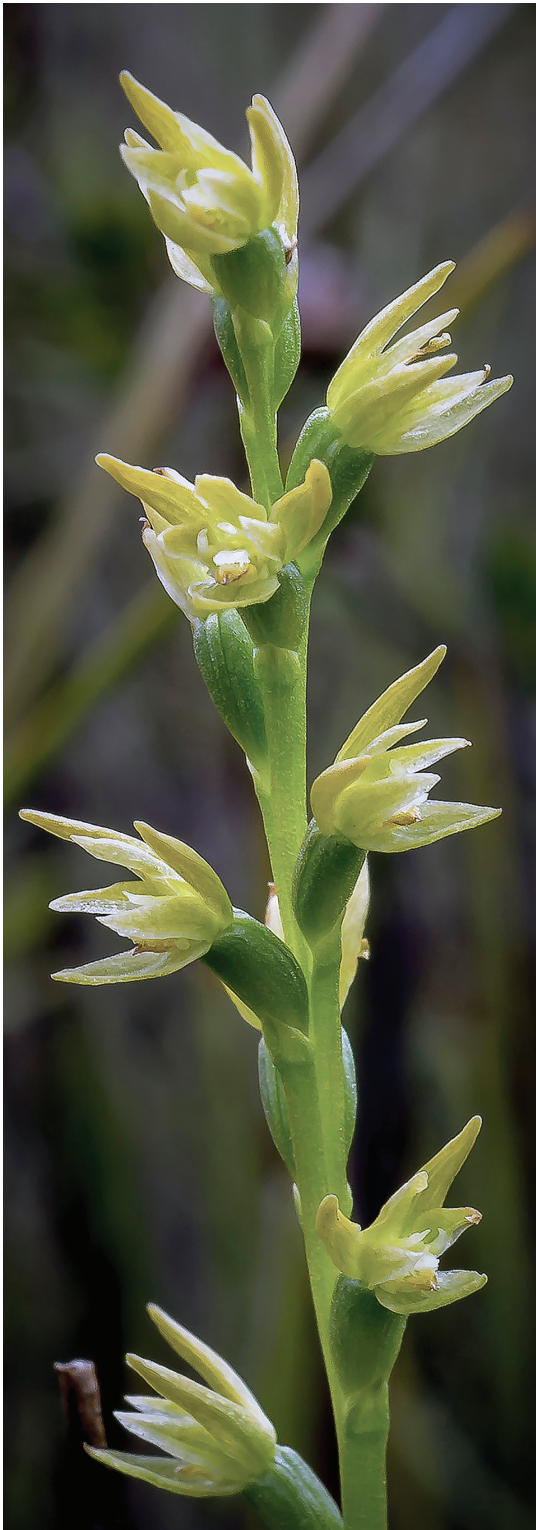
Figure 1. Prasophyllum abblittiorum