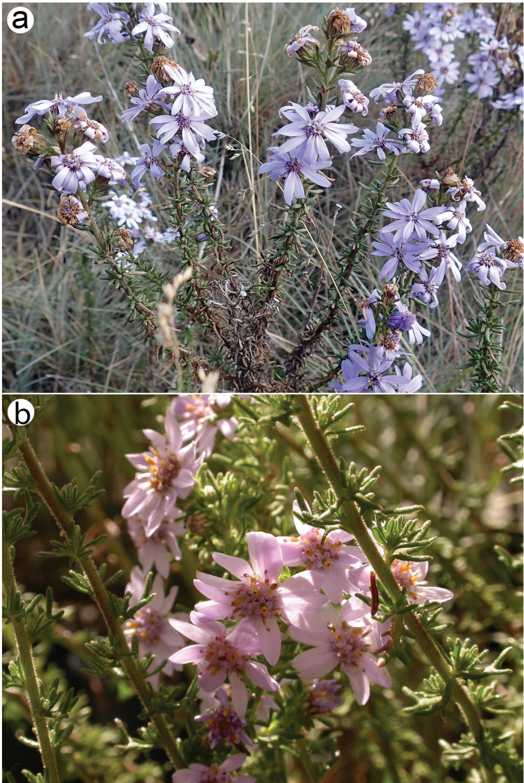
Figure 3. Olearia stricta . a. Olearia stricta subsp. stricta , Howitt Rd., Snowy Range (A. Messina 814, MEL2384920); b. Olearia stricta subsp. parvilobata , cultivated plant, RBGV.