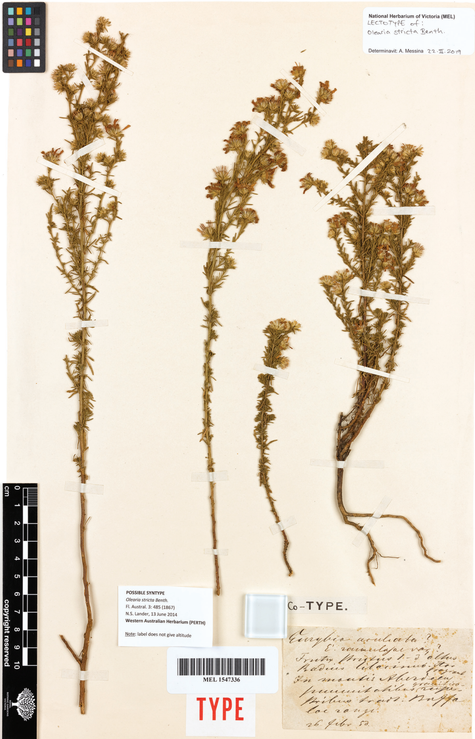
Figure 1. Lectotype of Olearia stricta (MEL1547336).