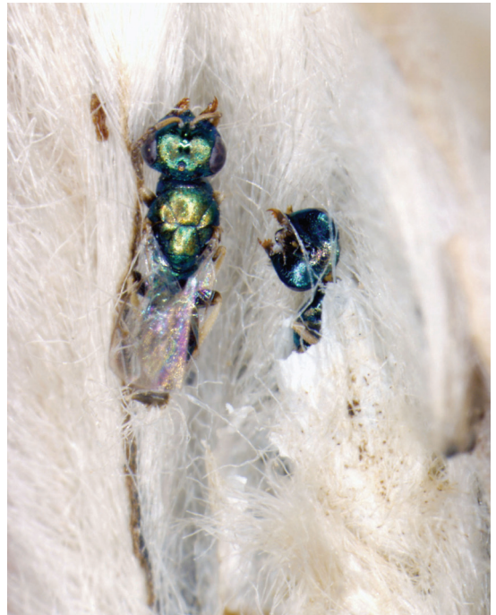
Figure 4. Galls caused by Dasineura tomentosa removed from herbarium specimens of Leptospermum laevigatum collected in 1875 and 1963 both contained similar parasitoid wasps.

Despite these limitations, herbarium collections do provide information that is invaluable for both botanists and gall midge taxonomists. In addition to determining a gall midge's geographic distribution over time, sites for collection of specimens for taxonomic purposes can