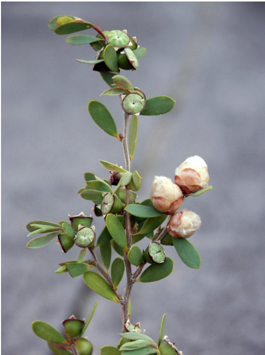
Figure 1. Galls on Leptospermum laevigatum growing in Queenscliff, Victoria caused by the gall midge Dasineura tomentosa . Mature galls 8 – 15 mm long and 7 – 12 mm wide..

inadvertently been recorded, and to determine whether there was any evidence of parasitoid wasp attack.