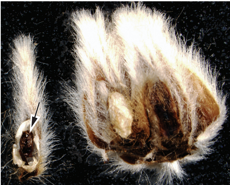
Figure 5. A dissected gall from a Leptospermum laevigatum specimen collected in 1887, with D. tomentosa pupa (indicated by arrow) still within the characteristic white silky cocoons formed on the outer bracts of the gall.