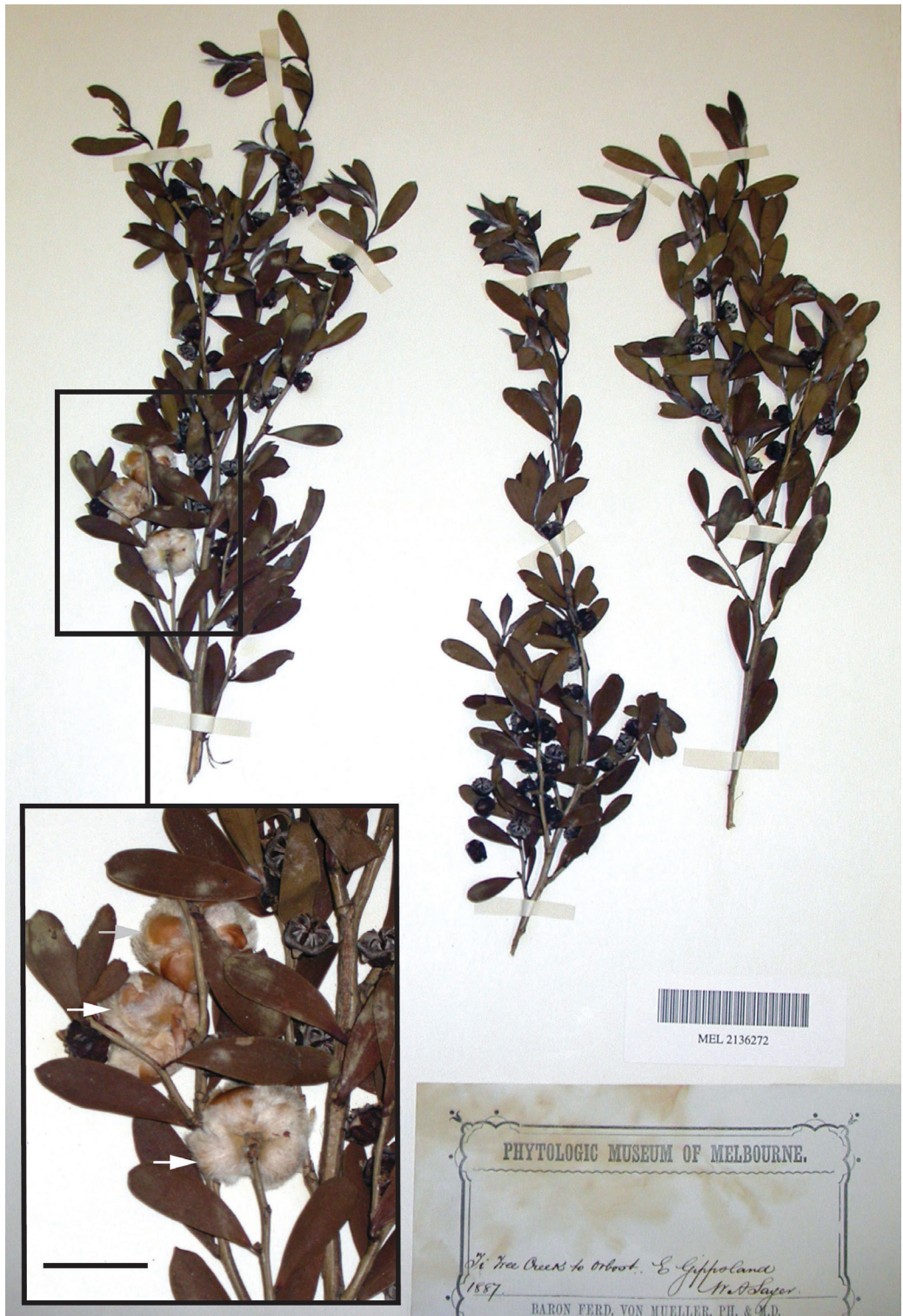
Figure 3. Herbarium sheet (MEL2136272) with Leptospermum laevigatum specimen collected in East Gippsland by W.A. Sayer in 1887. Arrows indicate galls caused by the gall midge Dasineura tomentosa . Scale bar = 10 mm.