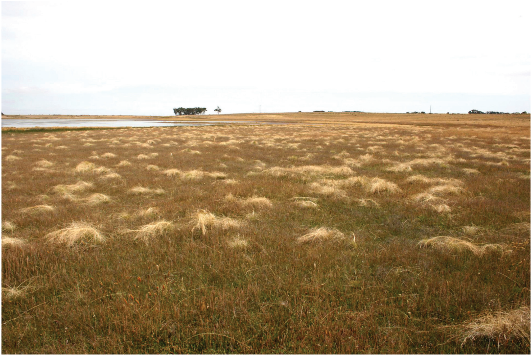
Figure 3. Poa physoclina in situ, Lake Burnie Bolac.

species it is readily distinguished by the weak culms that are readily laid flat by even gentle winds. (Fig. 3).