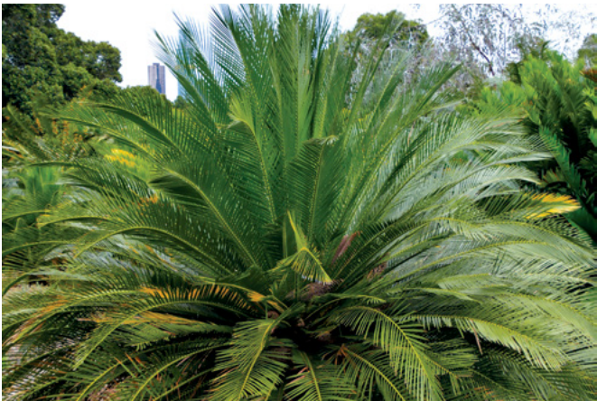
LEFT A Macrozamia communis at Royal Botanic Gardens Melbourne