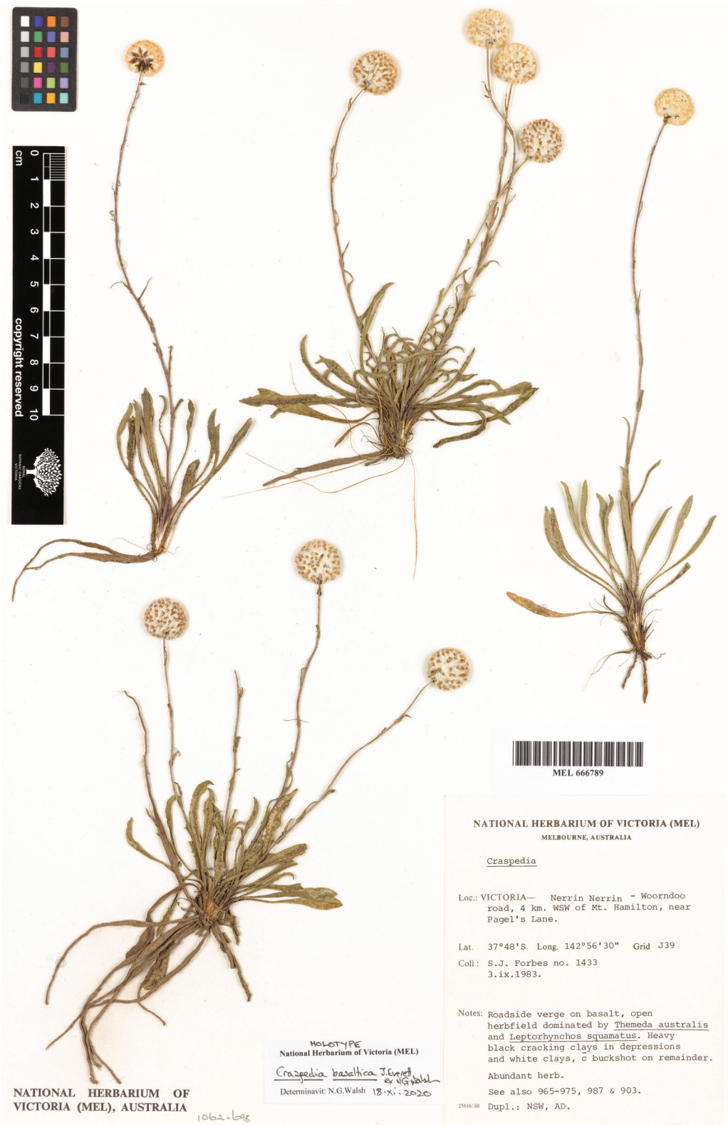
Figure 4. Craspedia basaltica Holotype (MEL 666789).