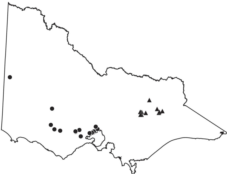
Figure 3. Distribution of Craspedia sylvestris (triangles) and C. basaltica (closed circles), based on herbarium collections at MEL.

Rosetted perennial herb, shortly rhizomatous; flowering scapes 1–4 per rosette, to 20(–30) cm high;