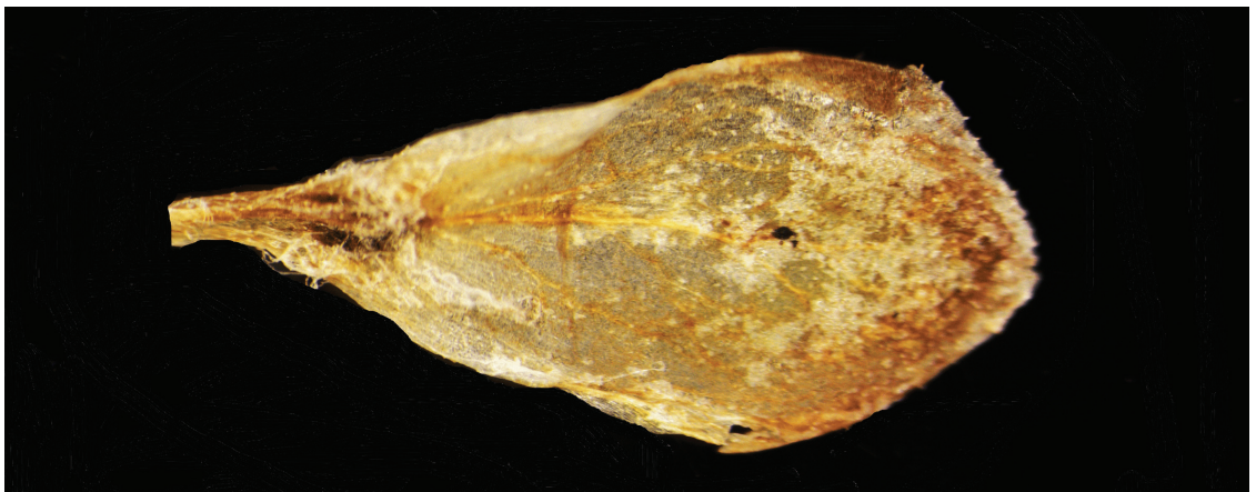
Figure 2. Craspedia sylvestris Capitular bract (from MEL 2045414).

Notes: The ovate to broadly ovate, narrowly-margined bracts of the individual capitula are distinctive and contrast to those of other species of subalpine to alpine Craspedia of similar habit (in particular C. aurantia , C. crocata which have broad hyaline margins, often widely dilated in the proximal half to the extent that the bract is somewhat 3-lobed. From C. aurantia it is further distinguished by the long 'petiolate' leaves and from C. crocata (which is generally a species of higher mountains in Victoria) by the overall more robust habit, broader leaves and bracts and proportionately larger inflorescences. Some 'shade' forms of C. variabilis J.Everett & Doust approach C. sylvestris in habit, but