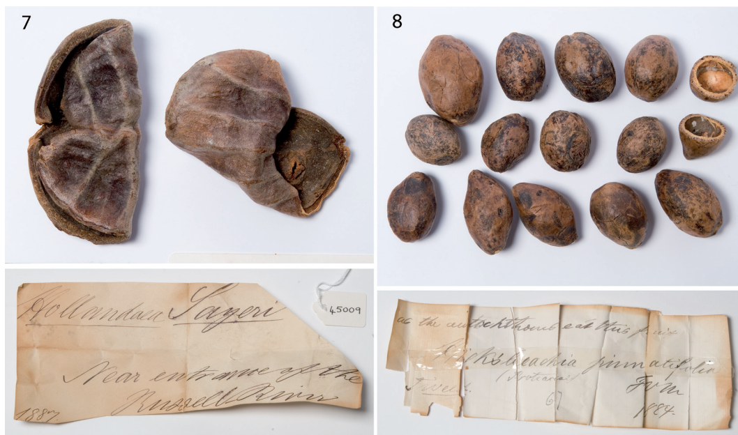
Figure 7. Helicia sayeriana EBC45009