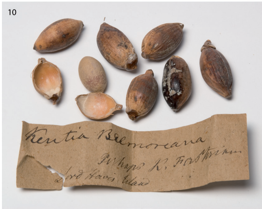
Figure 9: Kentia belmoreana EBC335693 © Board of Trustees of the Royal Botanic Gardens, Kew.