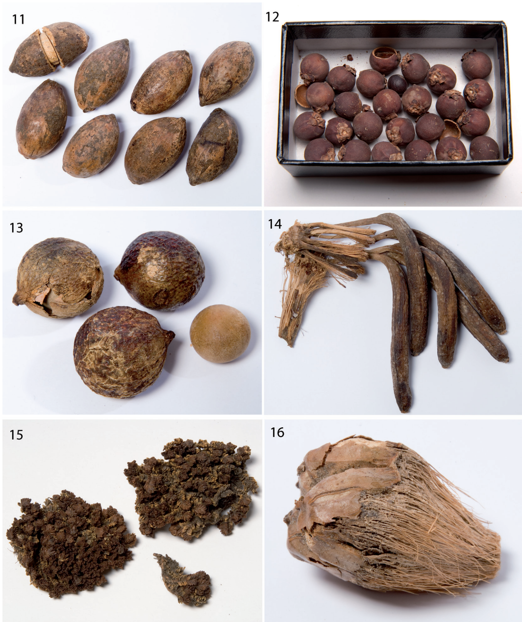
Figure 11: Kentia canterburyana EBC35690