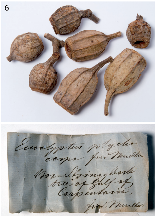
Figure 6. Eucalyptus ptychocarpa EBC55280