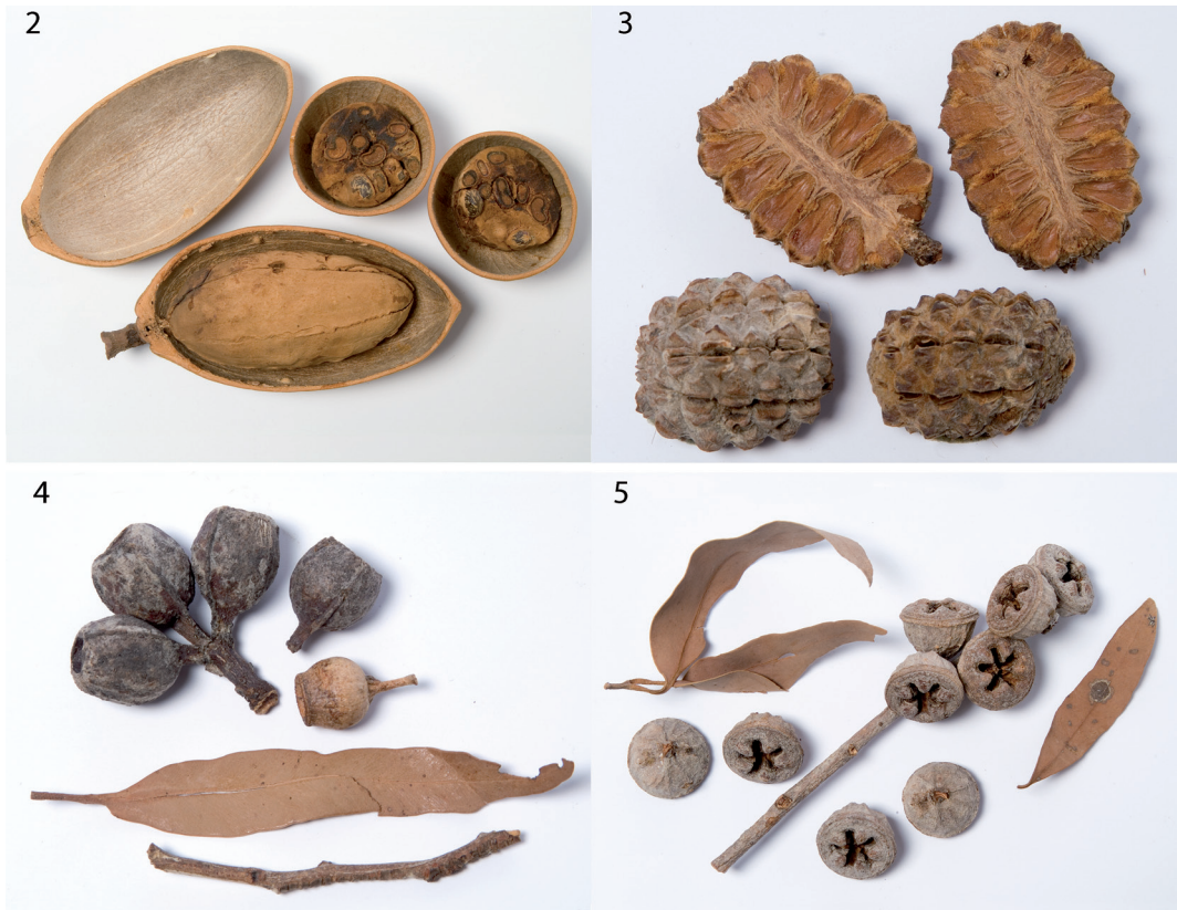
Figure 2: Adansonia gregorii EBC65247